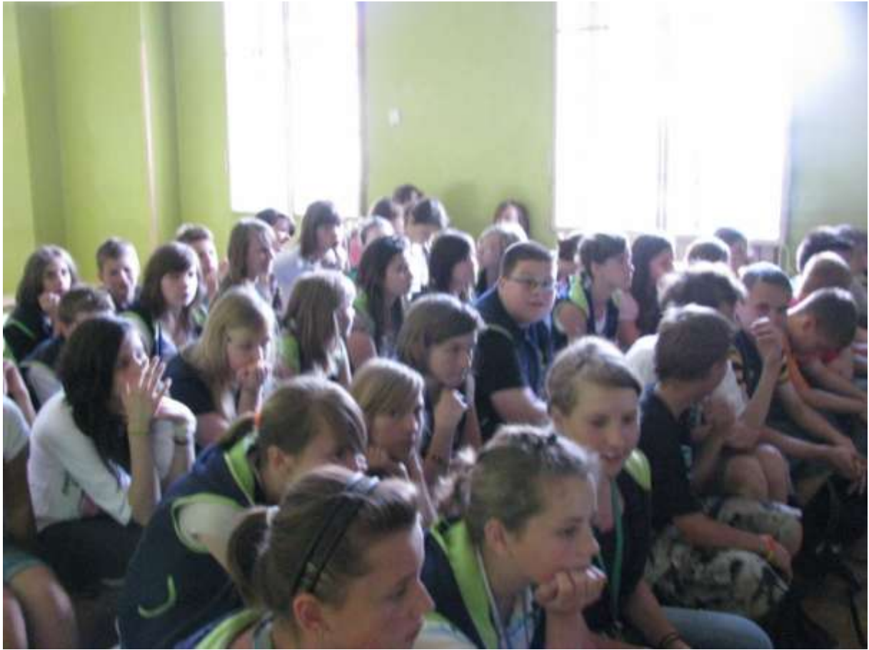
Class VI B